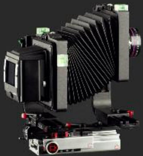
Lens rise for avoiding converging lines in architecture and studio work.