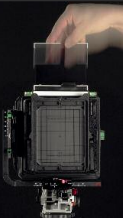
The Linhof Technikardan S is available for the two formats 2x3 and 4x5 in. Above: Technikardan S 4x5 in. with multi-format groundglass.

THE RESULT: Perfect images even when travelling without bulky luggage. Work on location for extremely demanding creative pictures. Full perspective control. Definition of depth of field. The Technikardan: Simply the ideal travel view camera for architecture, landscape and conceptional photography.