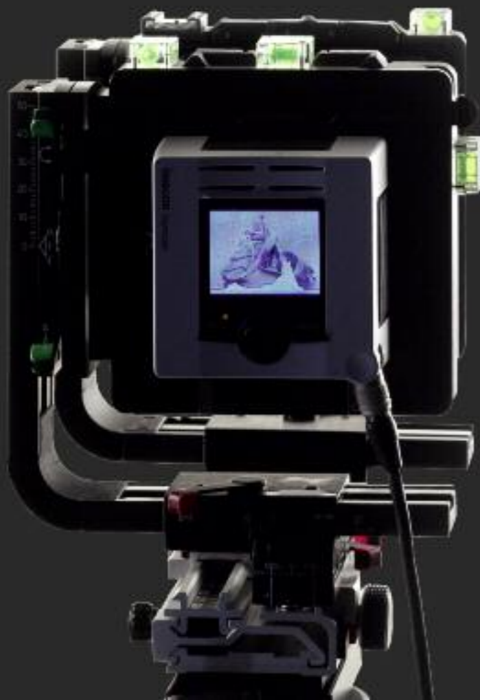
The Technikardan S 23 with Digi-Adapter and studio-independent digital back. A really professional but light-weight outdoor equipment.

The light weight Linhof Technikardan 23 is the perfect digital outdoor view camera when equipped with a studio-independent digital back. Working on location with all possibilities of creative imaging. Wide angle and shifting enlarge the use of digital view camera imaging up to architectural photography. The Digi-Adapter is available for TK 23 and TK 45. Various groundglass masks indicate the different chip formats – 24x36 mm, 37x37 mm or 4x5 cm.